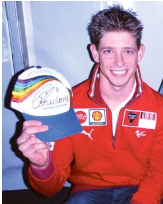
Casey Stoner at the 2008 Australian Motorcycle Grand Prix.