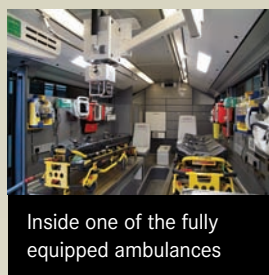
Inside one of the fully equipped ambulances

occur or when there are insufficient regular ambulances available. Up to 20 people can receive care from four specialist personnel in one of the ambulances.