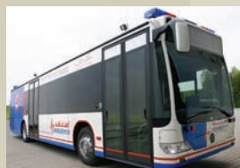
A Mercedes-Benz Citaro Mobile Clinic

The Mercedes-Benz Citaro chassis forms the platform for three new large capacity ambulances delivered to the Government of Dubai.