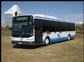
Bunbury City Transit adds two O 500LE's p4

For more information call your nearest Mercedes-Benz dealer