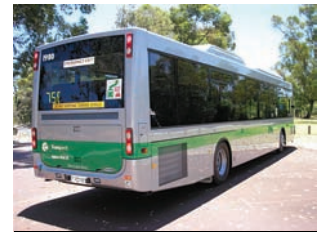
Transperth's new O 500LE is the 750th bus to be delivered in a multi-year contract

Over the period of the contract, Mercedes-Benz began supplying O 405NH's and then the O 500LE model. These replace earlier O 405 and O 305 models in service with the Transperth fleet.