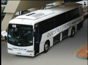
Peter O'Driscoll builds Tasmanian fleet p2