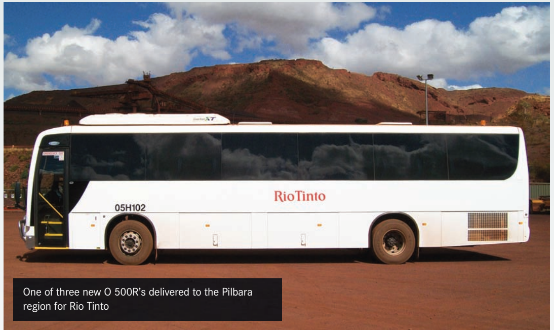
One of three new O 500R's delivered to the Pilbara region for Rio Tinto

Rio Tinto has a fleet of 17 large buses servicing 10 major sites in the Pilbara region.