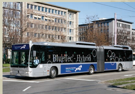
The Mercedes-Benz Citaro G BlueTec Hybrid articulated bus

More than 250 customers from fifteen countries recently had the opportunity to experience for the first time the Mercedes-Benz Citaro G BlueTec Hybrid articulated bus.