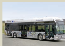
The new Mercedes-Benz Citaro FuelCELL Hybrid bus

The latest development in Mercedes-Benz FuelCELL buses was unveiled at the UITP Congress in Vienna in June: the Citaro FuelCELL Hybrid.