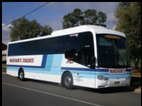
O 500R winning friends p3